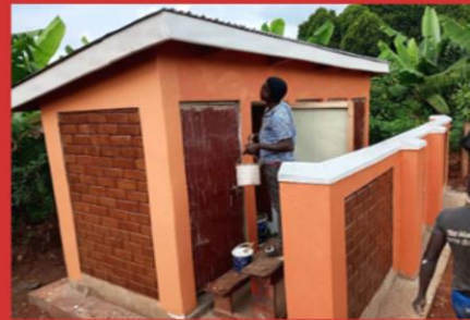
WASH-Water, Sanitation and Hygiene