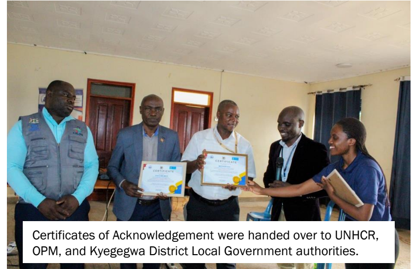
Certificates of Acknowledgement were handed over to UNHCR, OPM, and Kyegegwa District Local Government authorities.