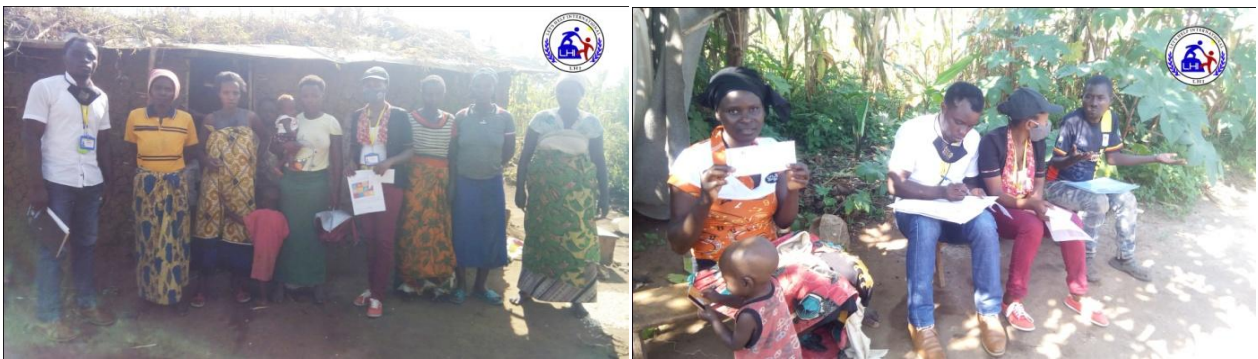
LHI Field officers sensitizing to people about F.P in Itambabiniga

Itambabiniga Ruchinga Cell, Kyaka II Refugee Settlement, Kyegegwa District, Uganda